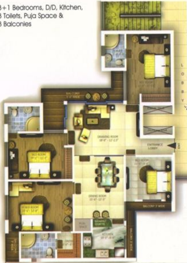
TYPE - A BUREAUCRAT TOWER (KING SIZE LUXURIOUS FLATS)

3+1 Bedrooms, D/D, Kitchen, 3 Toilets, Puja Space & 3 Balconies