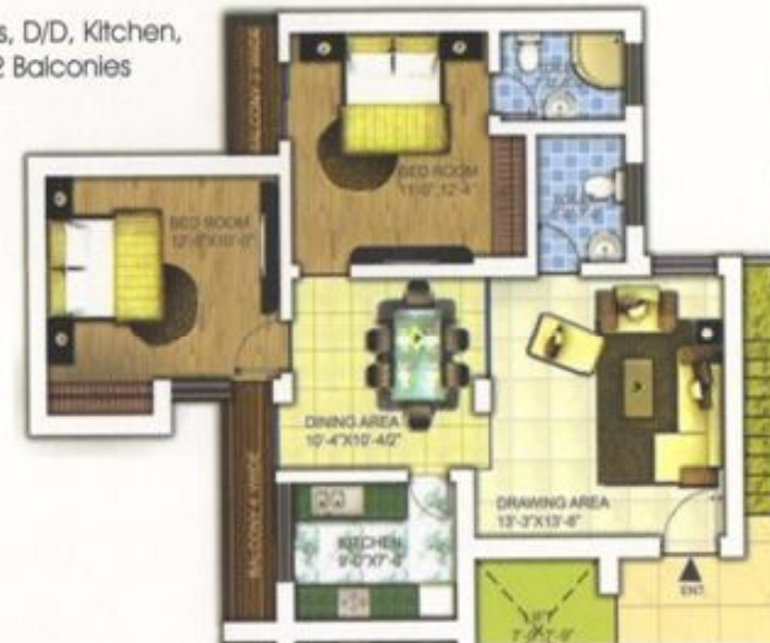
TYPE - B LEAF TOWER (2 BHK Luxurious Flats)

2 Bedrooms, D/D, Kitchen, 2 Toilets & 2 Balconies