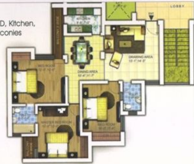
TYPE - A1 BIRD TOWER (3 BHK LUXURIOUS FLATS)

3 Bedrooms, D/D, Kitchen, 2 Toilets & 2 Balconies